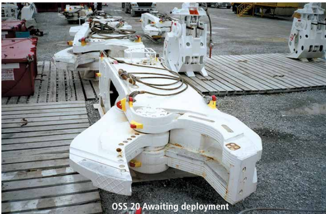
OSS 20 Awaiting deployment

These products are highly custom engineered to meet stringent requirements. Please call LaBounty at 800-522-5059 for specific details and specifications.