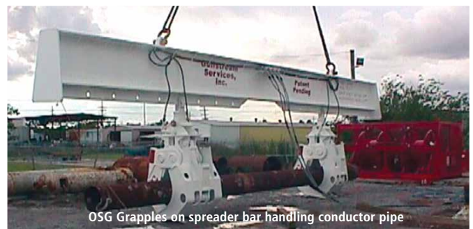
OSG Grapples on spreader bar handling conductor pipe