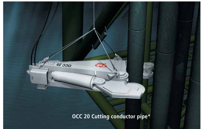
OCC 20 Cutting conductor pipe*