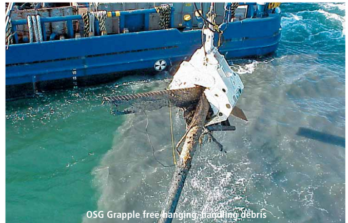
OSG Grapple free hanging handling debris